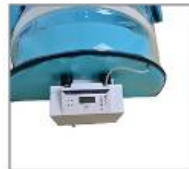
Negative Generation System